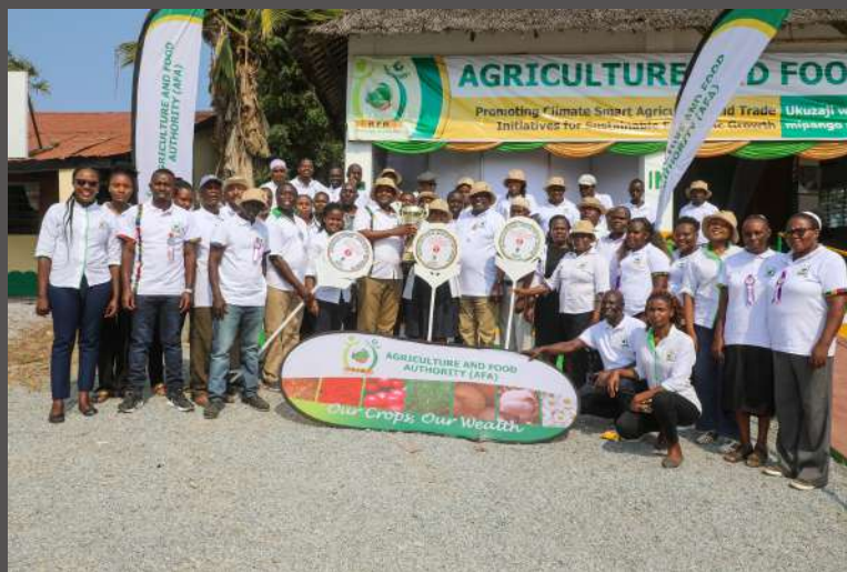
AFA Staff During Last Year's Mombasa International Show

AFA will be participating at this Year's Mombasa International Show, taking place on 4th September to 8th September 2024. We welcome you to come and visit our stand as we showcase the latest innovations in sustainable Agriculture and highlight the benefits of Climate-Smart Practices.