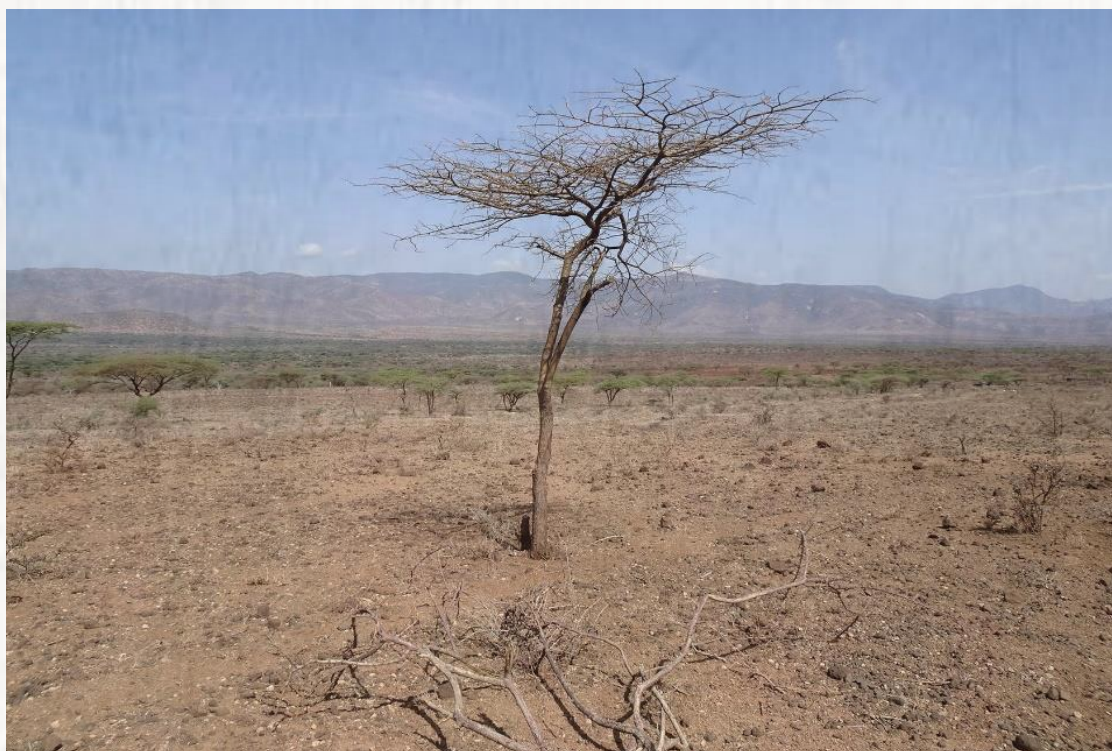
Fig.1: Drought-struck area in Laikipia